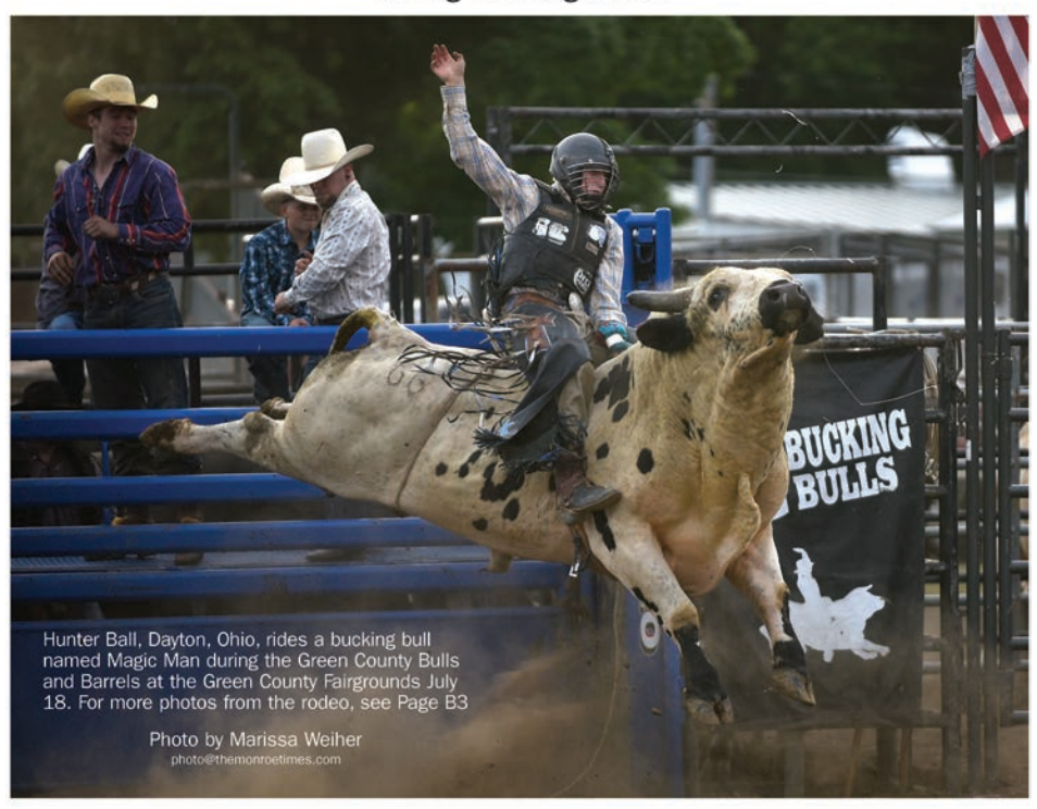
The Monroe Times, Division C, Sports Photo

Honorable Mention : The Stoughton Courier Hub, Bait and switch -