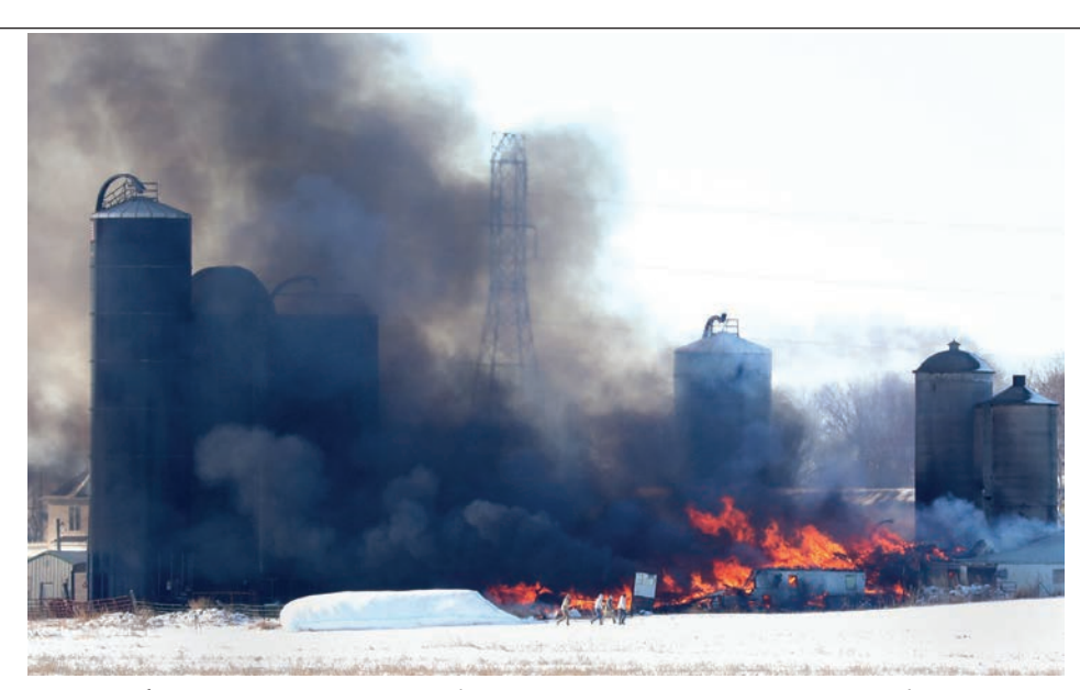
The Post-Crescent, Appleton, Division A, Spot News Photo

Division A First Place : The Gazette, Farmer-led